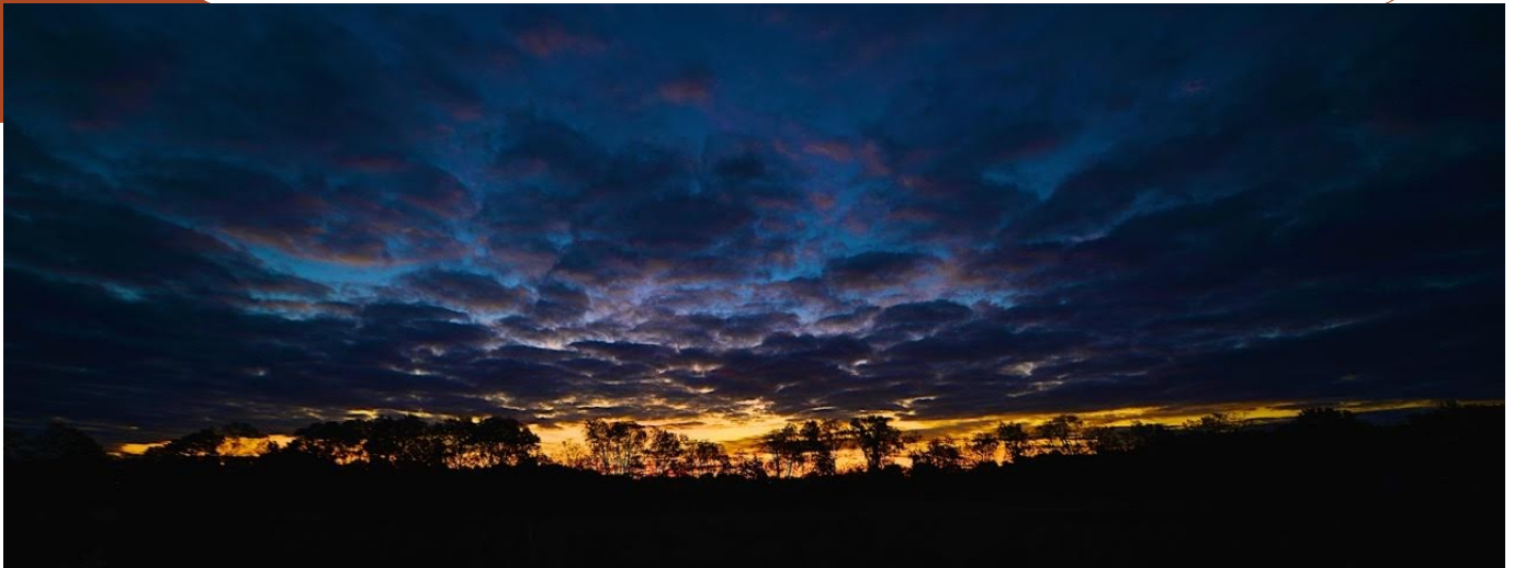
Fall Sunrise overlooking West Port Village—photo taken by Wes Freeland.